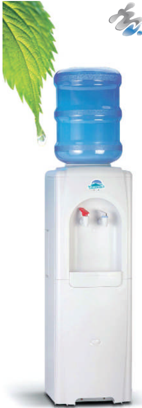
B10CH Hot & Cold (pictured) B10C Cool and Cold (also available)