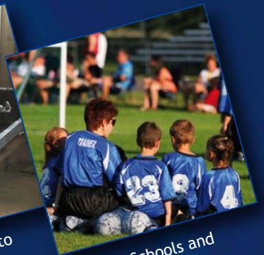
Ideal for Schools and Sporting Facilities