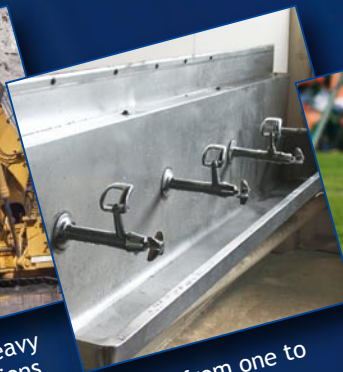
Supplies from one to six Remote Faucets