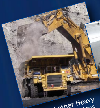
Mines and other Heavy Industrial Applications