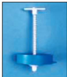
Non Spill Valve

No Spill Valve: Allows the bottle to be changed without spillage. The valve automatically opens and closes to release water only when required. (Fits most 8, 11, 15 & 19 litre bottles).